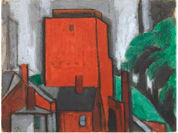
Oscar Bluemner (1867-1938), Fall River Theatre, 1922. Watercolor and gouache on paper, signed with monogrammed initials lower left: ‘OFB’; dated ‘Fall River Je 17-2’ and inscribed with notation on verso.