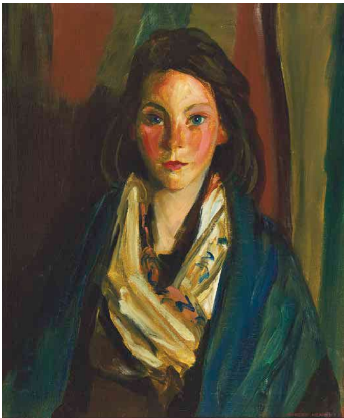
Robert Henri (1865-1929), Coleen, 1926. Oil on canvas, 23½ x 19¾ in.

Menconi + Schoelkopf will have its American Modernism show on view during the open house. The highly-curated exhibition includes work from Alfred Stieglitz, Marsden Hartley and Joseph Stella, and chronicles early modernism in the United States, beginning with the 1913 Armory Show . David Tunick, Inc. has been located just off Madison for 45 of its 50 years