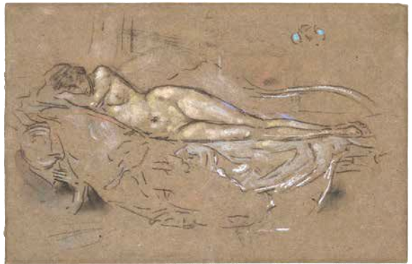
James Abbott McNeill Whistler (1834-1903), Nude Reclining, 1893-1900. Colored pastel and black chalk on brown wove paper laid down on card, 7 x 10 7 / 8 in., artist’s butterfly monogram in chalk upper right.